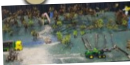
New Zealand Diorama – Leo