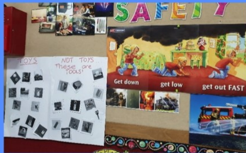
Fire wise: Keeping ourselves safe