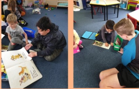
Buddy reading with Room 9