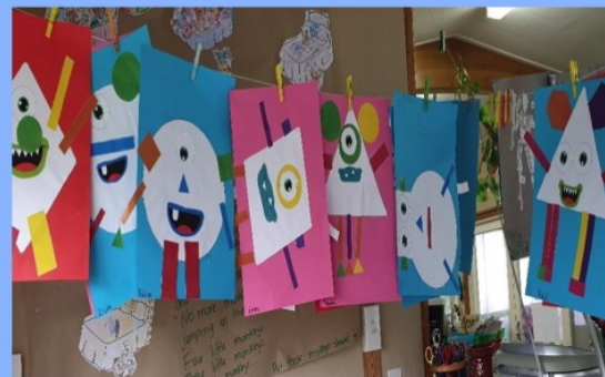
Geometry: Learning about 2d shapes