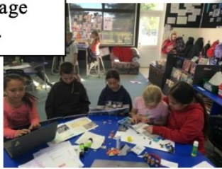
Researching and collage artwork.